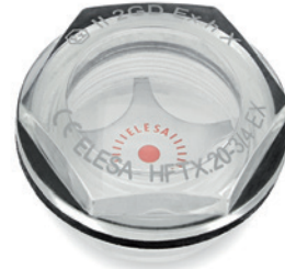
ELESa Original design

Brass nut GH. (see page 1574) for fitting to reservoirs with wall thickness smaller than 5 mm.